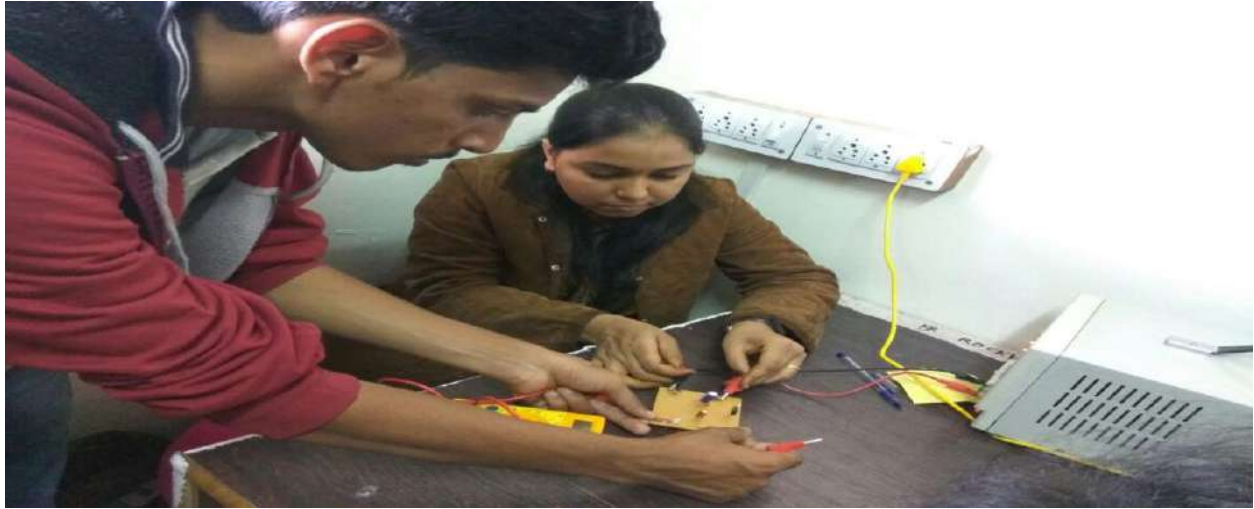
PCB Design and continuity check of PCB track