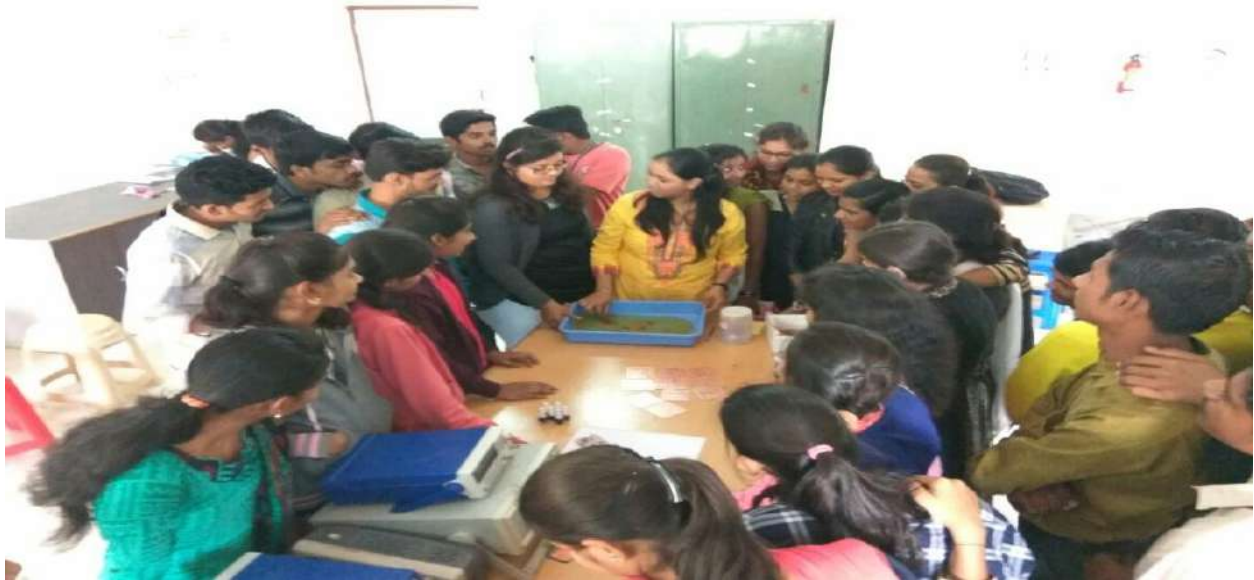
Demonstration of PCB Etching process